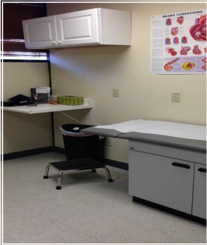
Exam Room 1