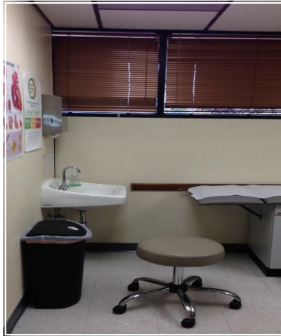
Exam Room 2