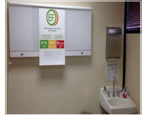
Exam Room 3